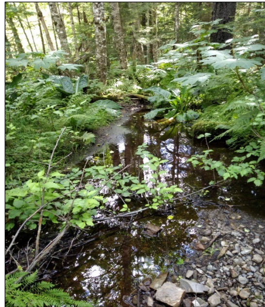
Figure 2. Downstream at waypoint 611.