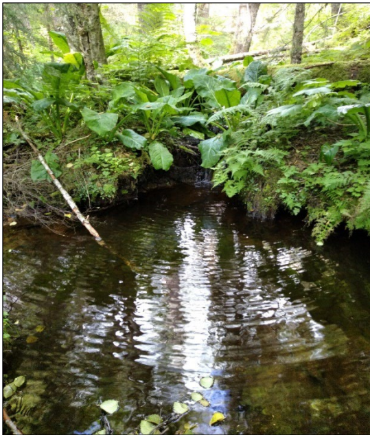
Figure 1. Upstream at waypoint 611.